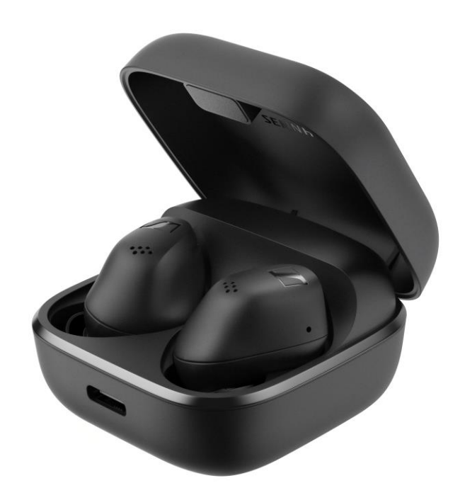
Pictured: ACCENTUM True Wireless in its compact Qi-enabled charging case

When combined with the discreet beamforming mic array, the ANC reduces droning low-frequency distractions to a whisper, making quick work of airplane cabin noise, humming appliances, nearby traffic and the murmur of bustling coffee shops. ACCENTUM True Wireless' Hybrid ANC and Transparency modes make it easy to manage disruptions, allowing wearers to listen to ambient surroundings on-demand via simple tap gestures or the free Sennheiser Smart Control app. With the app, the user can select the amount of transparency while further tailoring their sound using the 5-band equaliser and Sound Check–a guided preset creator that one can upload to the cloud to access on all of your iOS or Android devices. EQ customisation is only the beginning, with user-definable touch controls for managing media, phone calls, and voice assistants too.