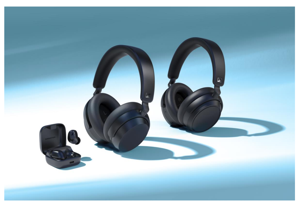
Pictured: The complete family (left to right); ACCENTUM True Wireless, ACCENTUM Wireless, and ACCENTUM Plus Wireless

ACCENTUM True Wireless is available for pre-order starting today and will officially launch on May 21st. The earbuds come in black or white colourways, and will be available from select retailers and at sennheiser-hearing.com with an MSRP of £169.99 / 199.99 EUR.