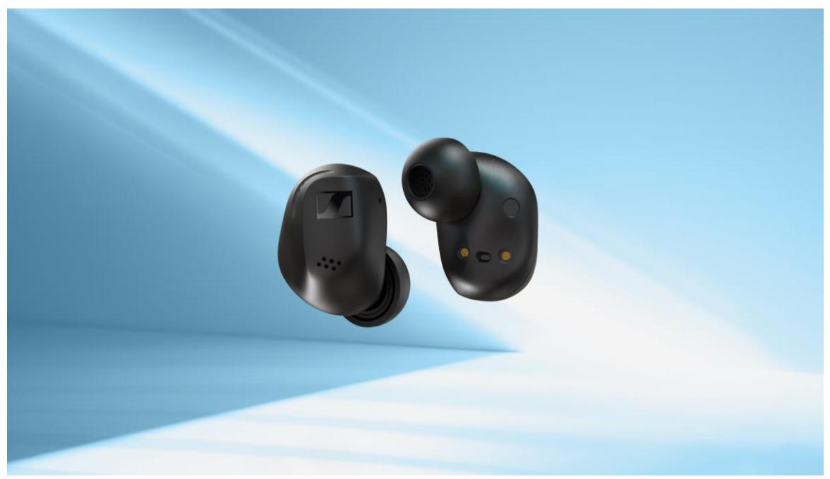
Pictured: ACCENTUM True Wireless is available in black (pictured) and white